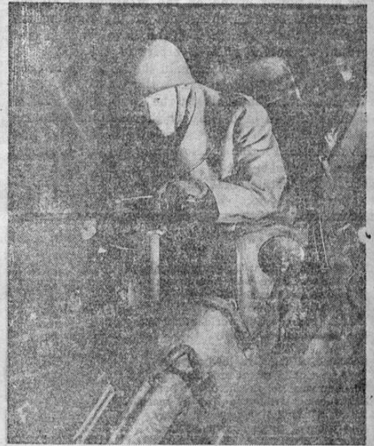
El capitán del ejército norteamericano que se ve en esta fotografía al volante de un carro "jeep," no es otro que el conocido astro de la pantalla, Jack Holt, quien se retiró del cine para ingresar como voluntario en las fuerzas armadas de los Estados Unidos.